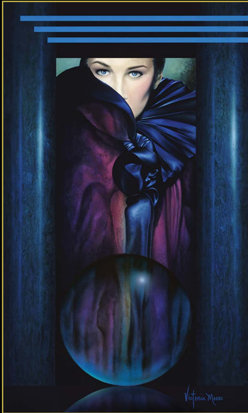
MYSTICAL VISION 60" x 36" oil and resin on masonite