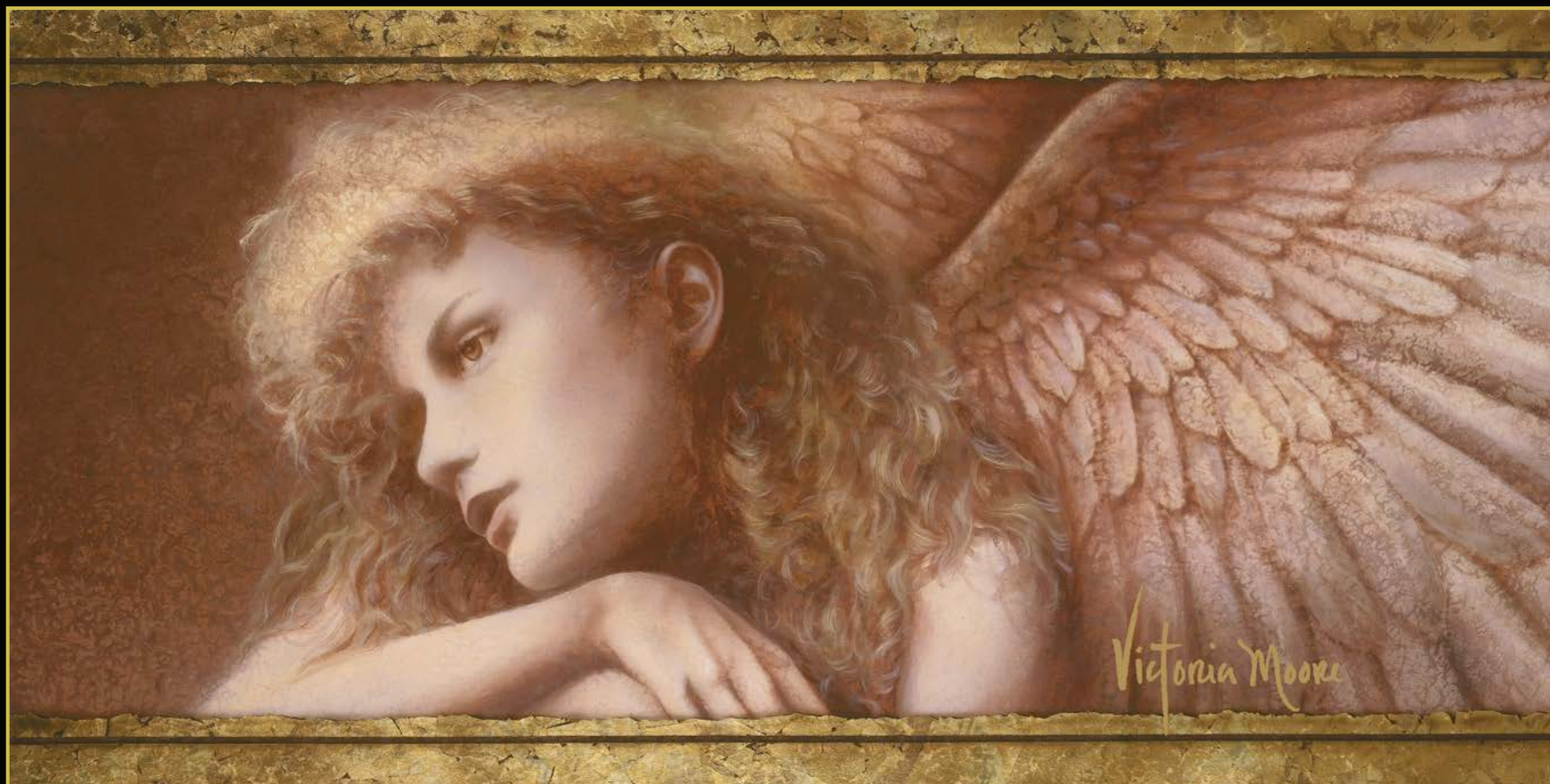
PRESENCE OF ANGELS I