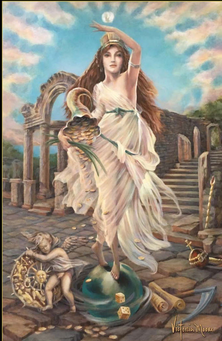
GODDESS TYCHE: 24" x 36 oil on canvas - (in-progress)