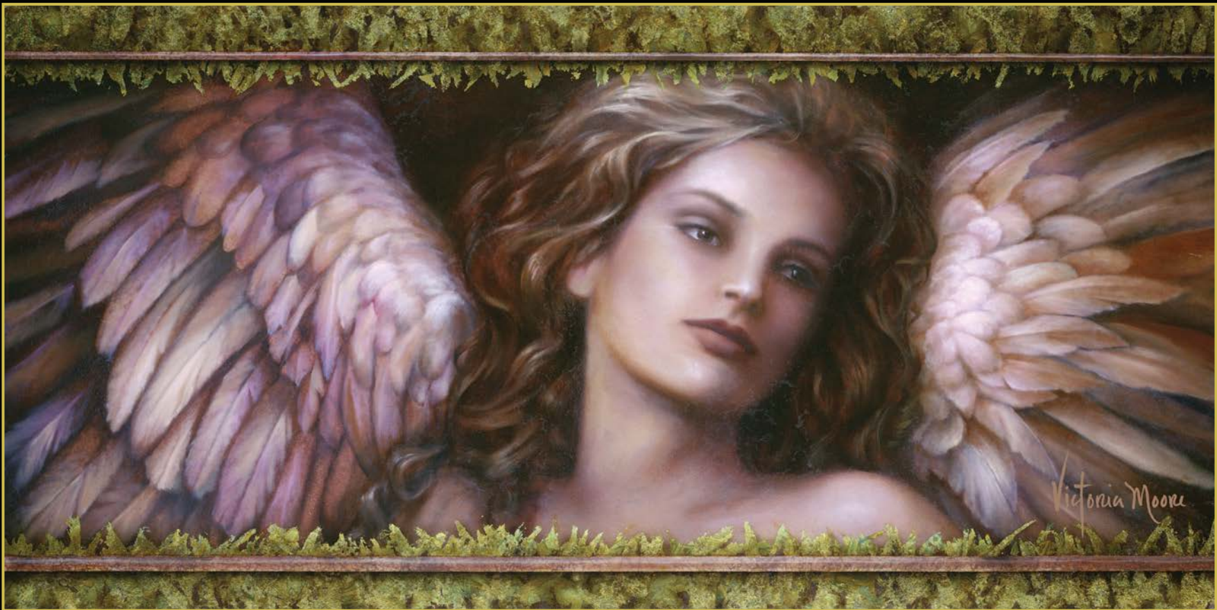
PRESENCE OF ANGELS II

During the process of trying to understand my near-death experience, the fates would have me spend a few days in the company of Betty Eadie, the prize-winning author of "Embraced by the Light". While our spiritual foundations were quite different, and the visuals of our individual experiences were more personalized, we did find numerous common threads that we pulled on to explore in detail.