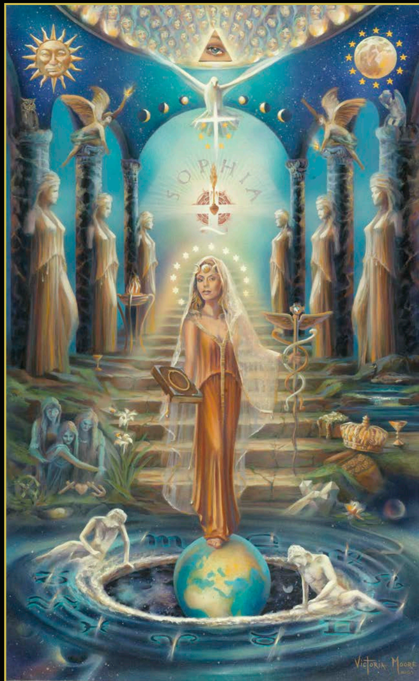
THE MYSTERY SCHOOL OF SOPHIA 30 x 48" oil on canvas